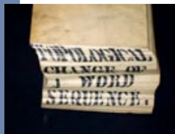
Luis Camnitzer, Topological Change of a Word Sequence 2 , 1969. Index cards, glue, and marker

This fall the Blanton Museum of Art presents two exhibitions of artists liv- ing in New York in the 1960s. Showing concurrently from September 28, 2008 to January 18, 2009, one is called Reimag- ining Space: The Park Place Gallery Group in 1960s New York and the other is The New York Graphic Workshop: 1964-1970 . We are looking forward to hosting these exhibitions.