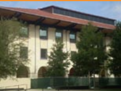
Edgar A. Smith Building, Blanton Museum Of Art