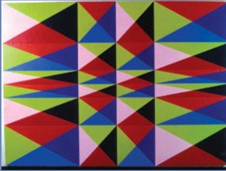
Dean Fleming, Lime Line , 1965. Acrylic on canvas 48 x 66 in., collection of the artist, Gardner, CO