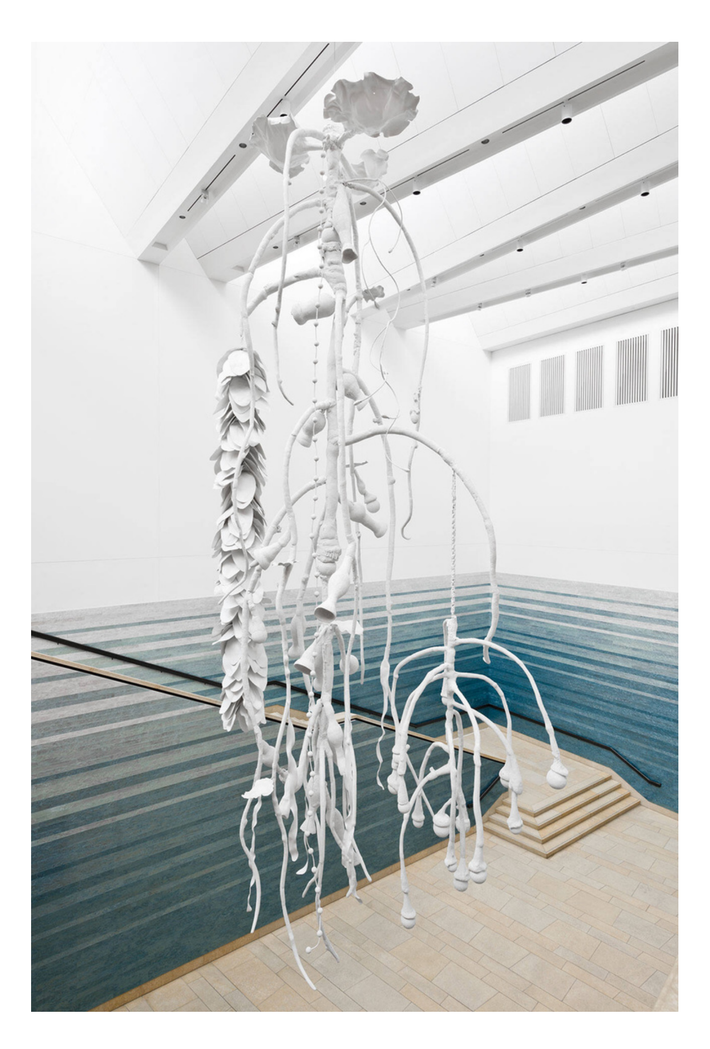
Tho mas Glass ford, \textbf{\textit{Siphonophora}}, 2016, 501 \times 192 \times 130 \text{ in., rebar, polyure thane foam, base coat cement, and paint. Blanton Museum of Art, The University of Texas at Austin, purchase through the generosity of the Moody Foundation, 2017.3